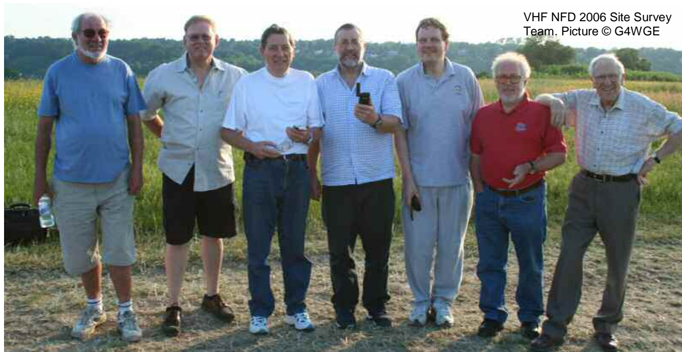
VHF NFD 2006 Site Survey Team.

73 and 88 Ray G4FFY Posted: 1 st Sep 2006