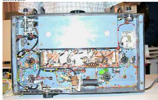
Underside of re-built HRO

The Zen bit, well there's a classic book "Zen and the art of Motor Cycle Maintenance" and the trick is to become one with the activity, to engage in it fully, to see and appreciate all details - be it hiking in the woods, penning an essay, or tightening the chain on a motorcycle. So discipline is needed and Brian followed a long and methodical process to rebuild the HRO. For example he drew out the layout of the IF stage and checked how it would all piece together before doing it. In total it took some 6 weeks, with drilling the chassis being quite difficult.