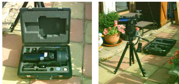
ETX90 in Pilot’s Case & Mounted on Std Camera Tripod

I have put up onto the Club web site a copy of Peter’s presentation ( www.g3src.org.uk ) on the Club Talks/Links page – beware it is some 4MB so I will split it up in due course. It gives more details on the telescopes listed above – the most portable of which is the ETX 90 which can be packed away in a pilot’s case.