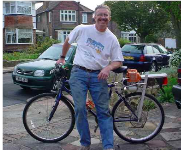
Next month, making my 'Mouse' road legal.

Photo shows me with 'Little Ripper', but I'm still waiting for the local vehicle licensing office to inspect it and issue a number plate!