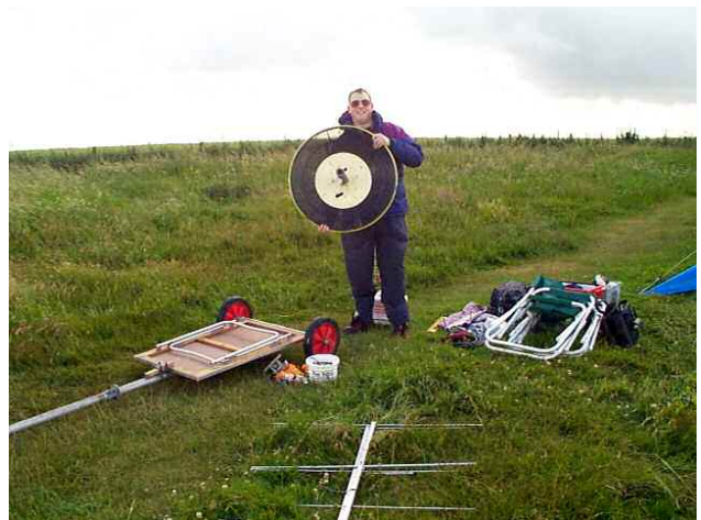
The "Cart" which gets the gear to the hilltop

providing it is only used for amateur purposes.