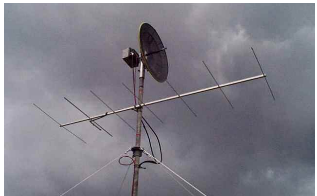
The Dish with Transverter + 2m Talkback Aerial

A real issue at microwave frequencies is Local Oscillator stability so temperature controlled techniques is now the norm. For the KU band the LO is at 10.224GHz and when operating in the field some 30m to an hour is needed for it to settle down and be within 5kHz.