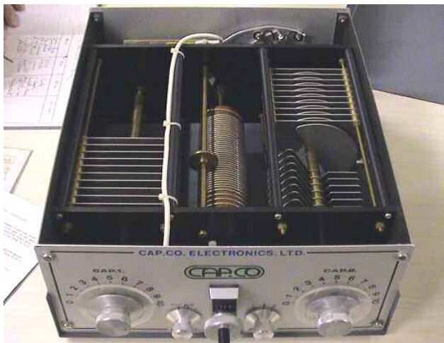
Cap.Co SPC3000D ATU