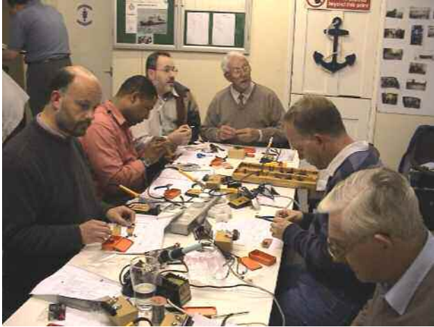
Some of the Constructors