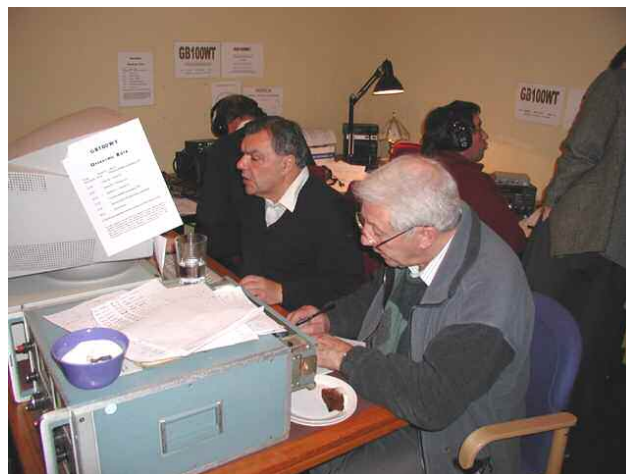
GB100WT – 12 th Dec 2001

This took place on 12 th December and whilst I'll await a full report I do have photos courtesy of Roger G4WAY (This is a sample as Roger took 9 in all – they will eventually appear on our WEB site when I get around to it!!):