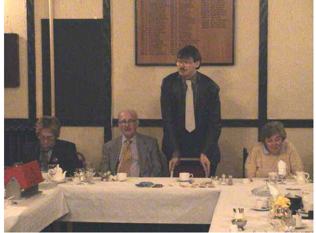
Chairman's GOPAR After-Dinner Speech

This was a great success enjoyed by all who attended on Saturday evening, 23 rd Mar 2002. We tucked in to a three-course meal choosing from Melon or Prawn Cocktail, Roast Pork or Beef, Sherry Trifle or Fruit Cocktail, finished off with Tea or Coffee.