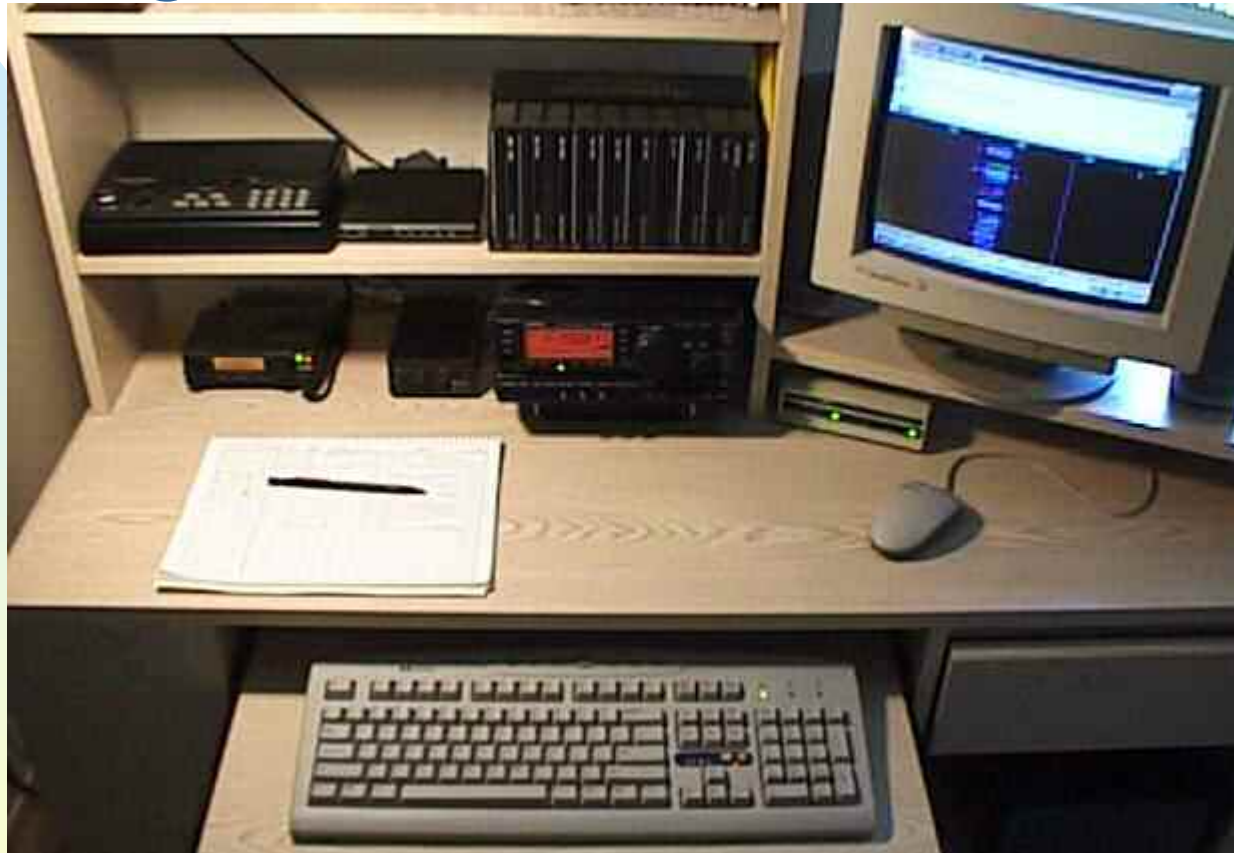
The station of Dave KB5WIA