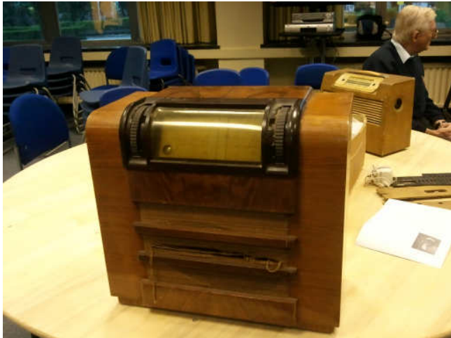
EKCO AW 98 - G8RUZ

Roger G4WAY kindly took pictures on the night and here are a few of them: