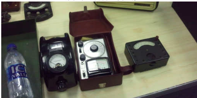
Test Meters - G4DDY