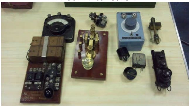
Bits and Pieces - G3KQR