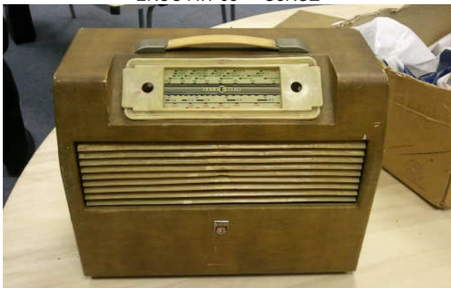
EKCO MBP 99 - G8RUZ