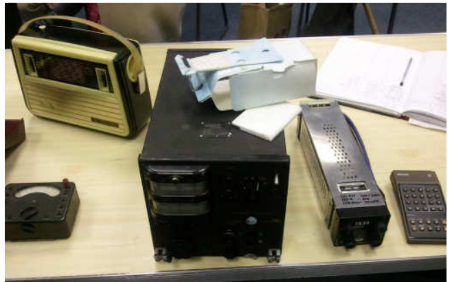
Air Craft Radio Marconi Type AD94 – G3ENG